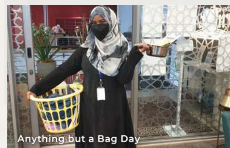
Anything but a Bag Day