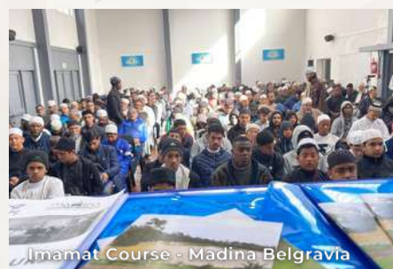
Imamat Course - Madina Belgravia