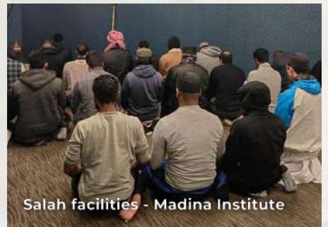
Salah facilities - Madina Institute