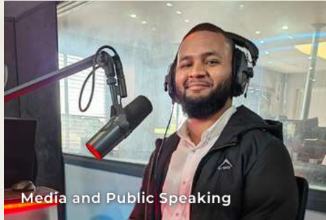
Media and Public Speaking