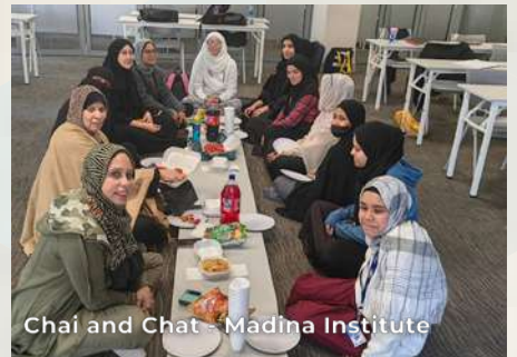
Chai and Chat - Madina Institute