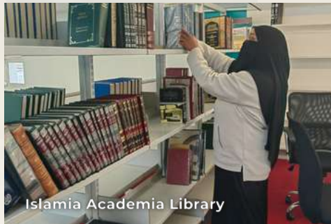
Islamia Academia Library