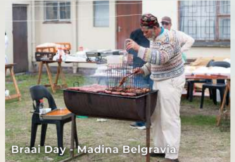
Braai Day - Madina Belgravia