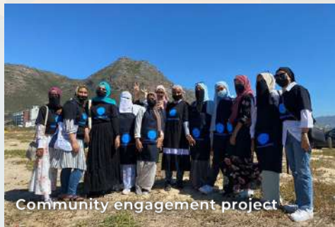
Community engagement project