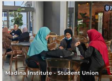
Madina Institute - Student Union