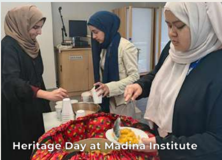
Heritage Day at Madina Institute