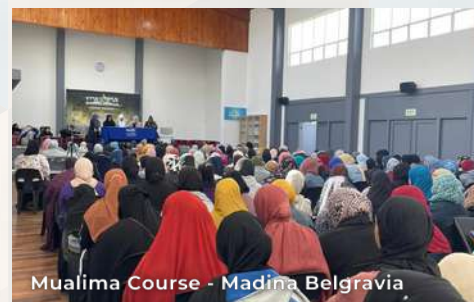
Mualima Course - Madina Belgravia