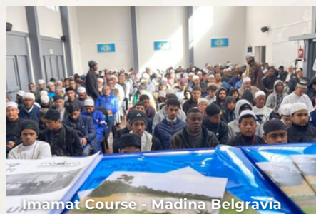
Imamat Course - Madina Belgravia