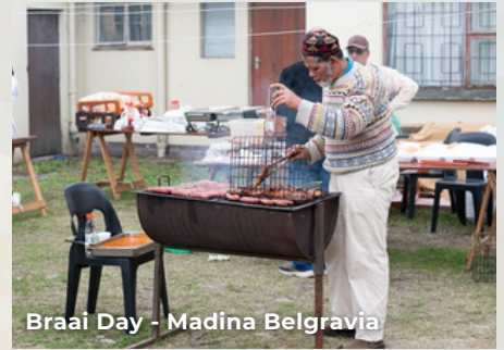
Braai Day - Madina Belgravia