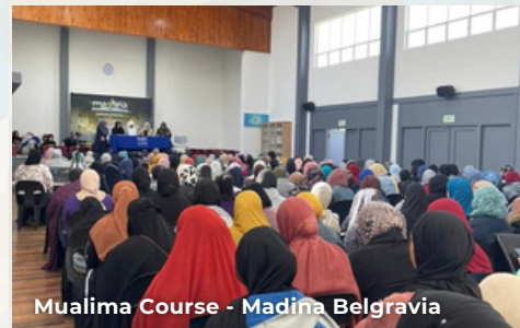
Mualima Course - Madina Belgravia