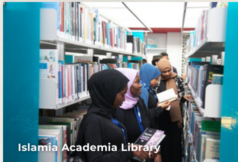
Islamia Academia Library