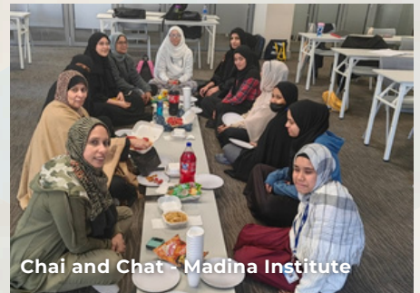
Chai and Chat - Madina Institute