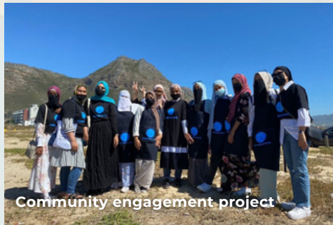
Community engagement project