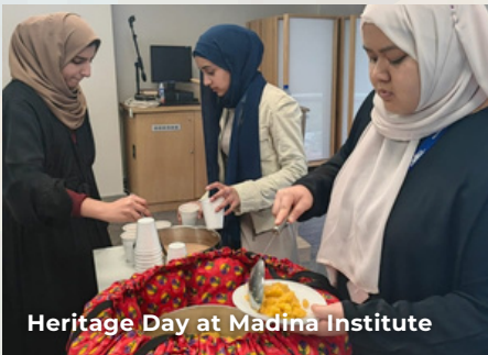
Heritage Day at Madina Institute