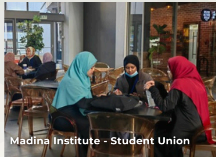
Madina Institute - Student Union