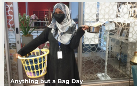
Anything but a Bag Day