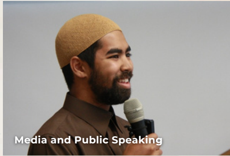
Media and Public Speaking