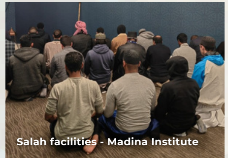
Salah facilities - Madina Institute